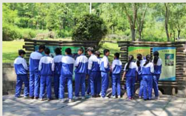
◆ Group photo of Wangwushan-Daimeishan UNESCO Global Geopark geosciences summer camp