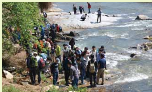
◆ Experts are visiting the Xindian scientific spot