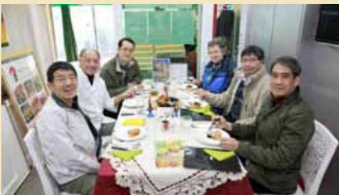
◆ Judging Panel (right)