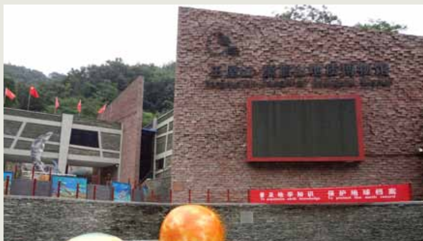
✦ Wangwushan-Daimeishan UNESCO Global Geopark Museum

“Geoscience popularization into school, community and scenic areas” has been carried out. Since 2012, geosciences education activities have been carried out on every Earth Day on 22 April and Geosciences Education Week. The activities including “The 10 th Anniversary Exhibition of Global Geoparks in China”, science popularization lectures, geosciences popularization summer camp, science knowledge contest, agritainment geosciences training, prized collection of geopark photographs, etc. Besides, 25 volunteers from 10 colleges in China have been recruited to carry out science popularization camp activities. The volunteers are encouraged to involve, experience, learn and diffuse the geosciences popularization, geoheritage conservation and special characteristic economy by Wechat and blog, etc. to comprehensively promote the reputation and influence of Wangwushan-Daimeishan UNESCO Global Geopark.