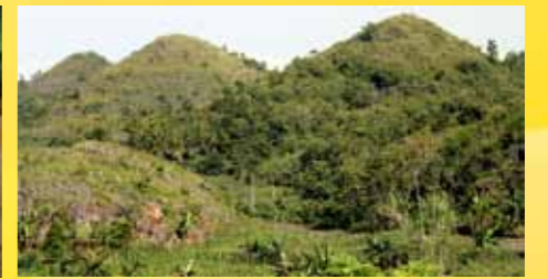
✦ Tropic conical karst of Gunung Sewu (Indonesia)