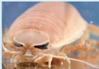
✦ Marine isopod(Bathynomus doederleini)