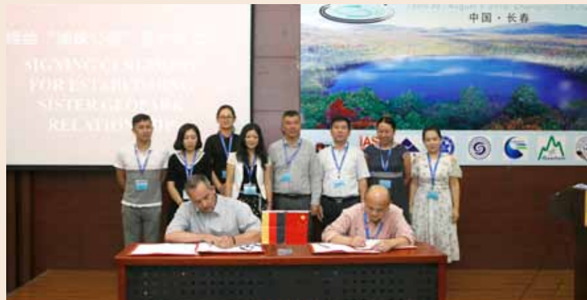
◆ Group photo after signing agreement

Maar type volcanic lake is rare and unrenueable precious geo-resource in the world. It is a natural yearbook and natural museum for scientific research of paleoclimate and paleoenvironment. The maar lake in Vulkaneifel of Germany is the starting point of European and even the world's research on maar lakes. Zhanjiang Huguangyan is