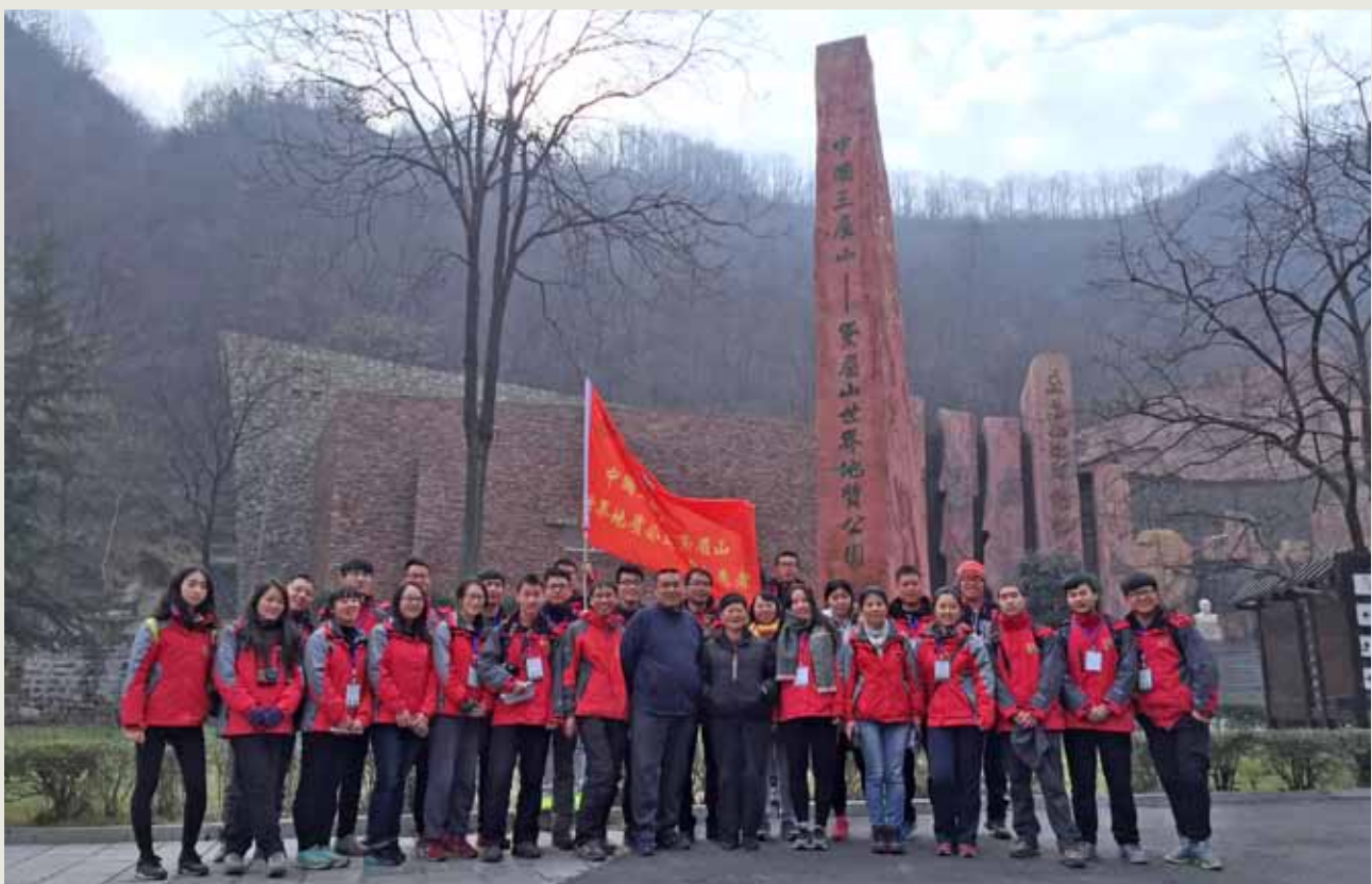
◆ Training camp activity of the popular science volunteer