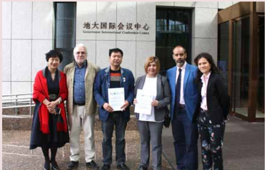
◆ Representatives of the two geoparks