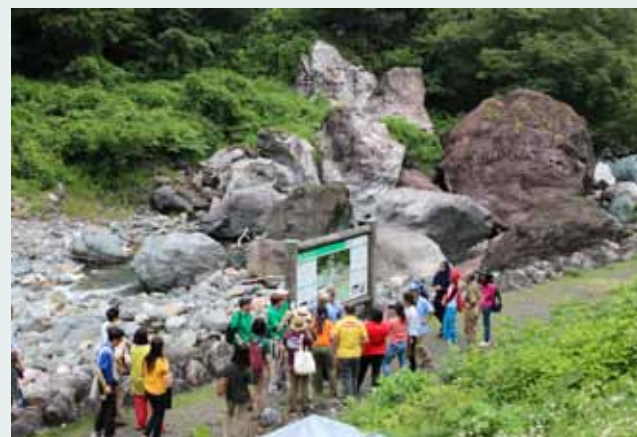
➤ Attendees visit the Kotakigawa Jade Gorge Geosite in Itoigawa UNESCO Global Geopark