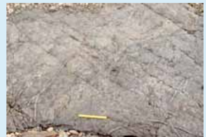
✦ trace fossil