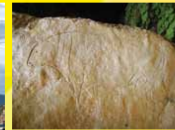
✦ Pollino (Italy)