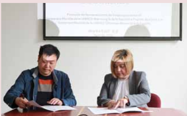
◆ Signing sister-park agreement

a proper time. After the meeting the representatives of both parks signed the sister-park agreement. According to the agreement, the two parks will carry out exchanges and cooperation in respects of geopark development and management, geoscience research and education, geotourism promotion and capacity building, etc.