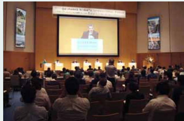
➤ A panel discussion concluded the two day forum