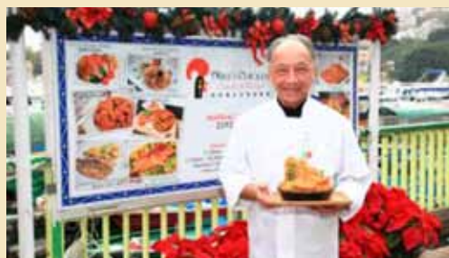
◆ Mike's Chicken Comida de Portugal: Portuguese Geo-Toast

creative ideas with the HKGP staff when preparing their creations. “We’re delighted to work together with other stakeholders to promote our food and Hong Kong Global Geopark at the same time,” said one chef. For the special occasion, L’hotel Island South, a geopark hotel, designed two special cold drinks – “Choco Rocks” and “Seaside Hexagon” – to celebrate the first