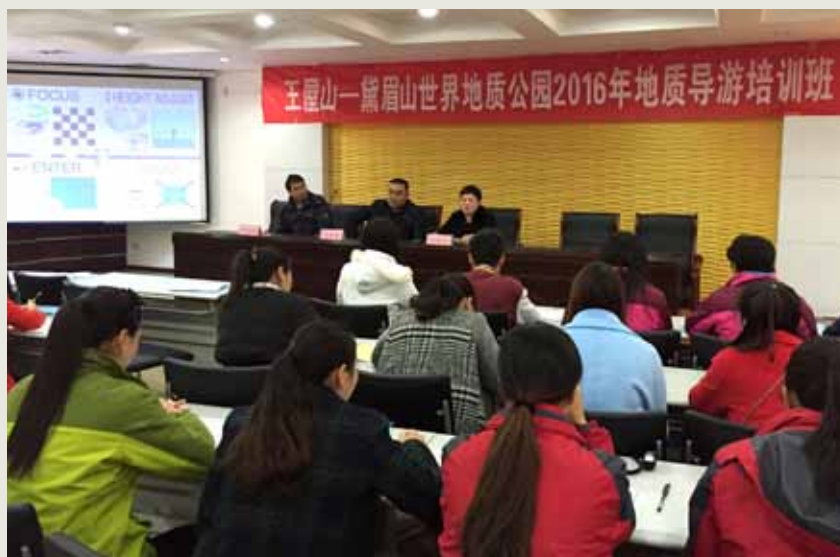
✦ Training camp activity of the popular science volunteer

geoheritages conservation have been issued. Signboards for conservation and interpretative science popularization have been set up at the significant geosites within the geopark; the newly found geoheritages in Jiyuan Basin have been recorded and conserved, and protection fence has been built. Moreover, the geoheritages within the geopark are patrolled on a regular basis; the persons who damage the geoheritages and science popularization signboards will be charged criminal liability.