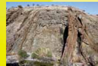
✦ Spectacular exposure of the Lower Pillow Lavas in the Maroullena river of Troodos (Cyprus)