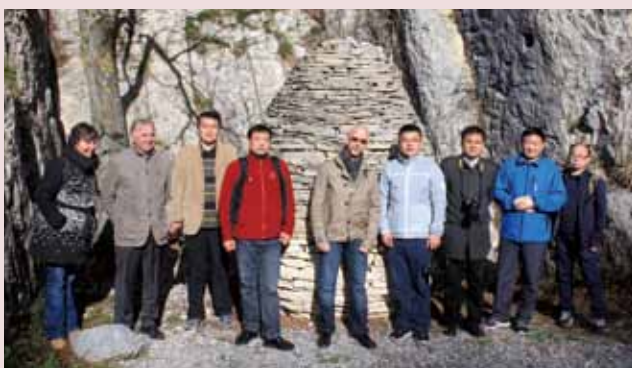
✦ Visiting cultural site