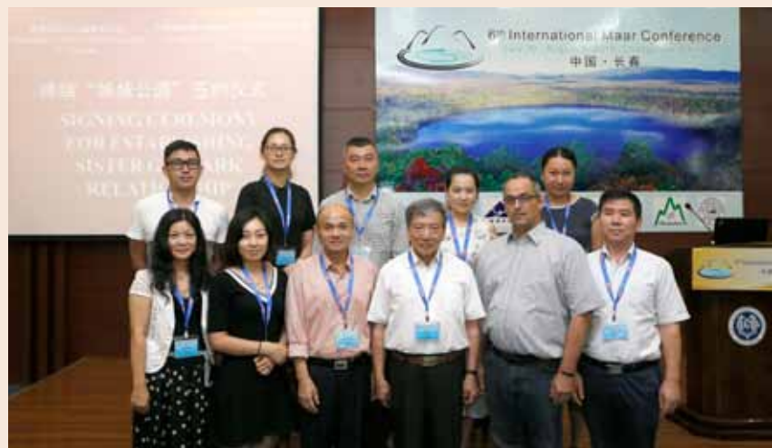
◆ Sister-park cooperation agreement signed by both geoparks

typical representative of Chinese maar lakes. Huguangyan maar lake is one of the best preserved volcanic crater lake in China and even in the world. The sediments of the lake are regarded as a natural yearbook for transition of natural environment. Huguangyan is the starting point for China's research on maar lakes, also an important base for the world's research on maars.