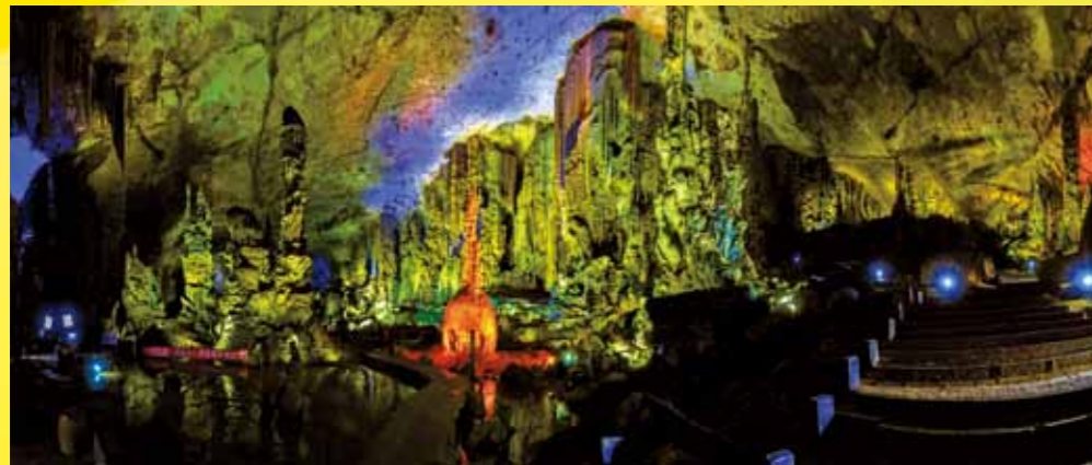
✦ Zhijindong Cave(China)