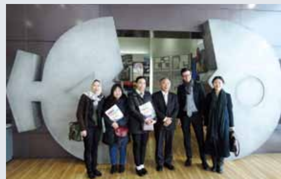
◆ Group photo at the Oyashirazu Geosite