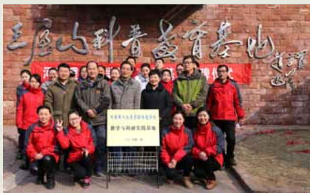
◆ Sign the agreement about Teaching and Science Study Practice Base between Henan polytechnic University and Wangwushan-Daimeishan Global Geopark to build friendly and cooperative relationship.

Great importance has been attached to the comprehensive rectification based on the six recommendations given by the experts in last revalidation. The leading group for rectification has been established and improvement plan has been made. Many improvements including infrastructure construction, newly built science popularization education centre