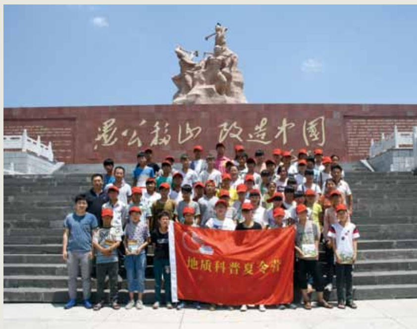
◆ Group photo of Wangwushan-Daimeishan UNESCO Global Geopark geosciences summer camp

In recent years, great progress and outstanding achievements have been made in geoheritage conservation, geoscience popularization, construction and management of the geopark, communication and cooperation in Wangwushan-Daimeishan UNESCO Global Geopark. We have been sticking to the principles of strict conservation, unified management, scientific planning and sustainable use. It has been awarded many honors like “One of the Top Ten Beautiful Landscapes”, “the Most Beautiful Geopark of China”, “the first prize of Advanced Team Award for Geosciences Education”, and “Advanced Team in Land Resources Management System of China”.