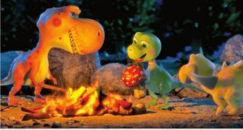
"Jurassic adventure" video screenshot