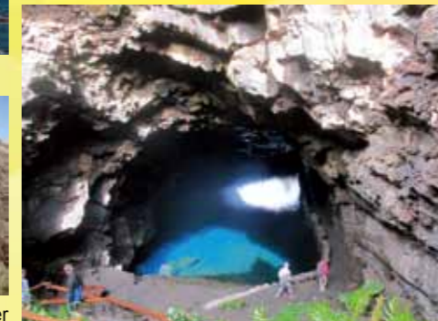
✦ Lanzarote and Chinijo Islands Geopark (Spain)