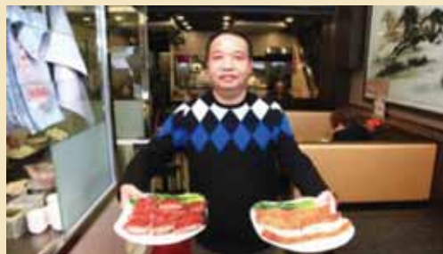
◆ Man Nin Wah Roasted Meat Restaurant: Layer by Layer