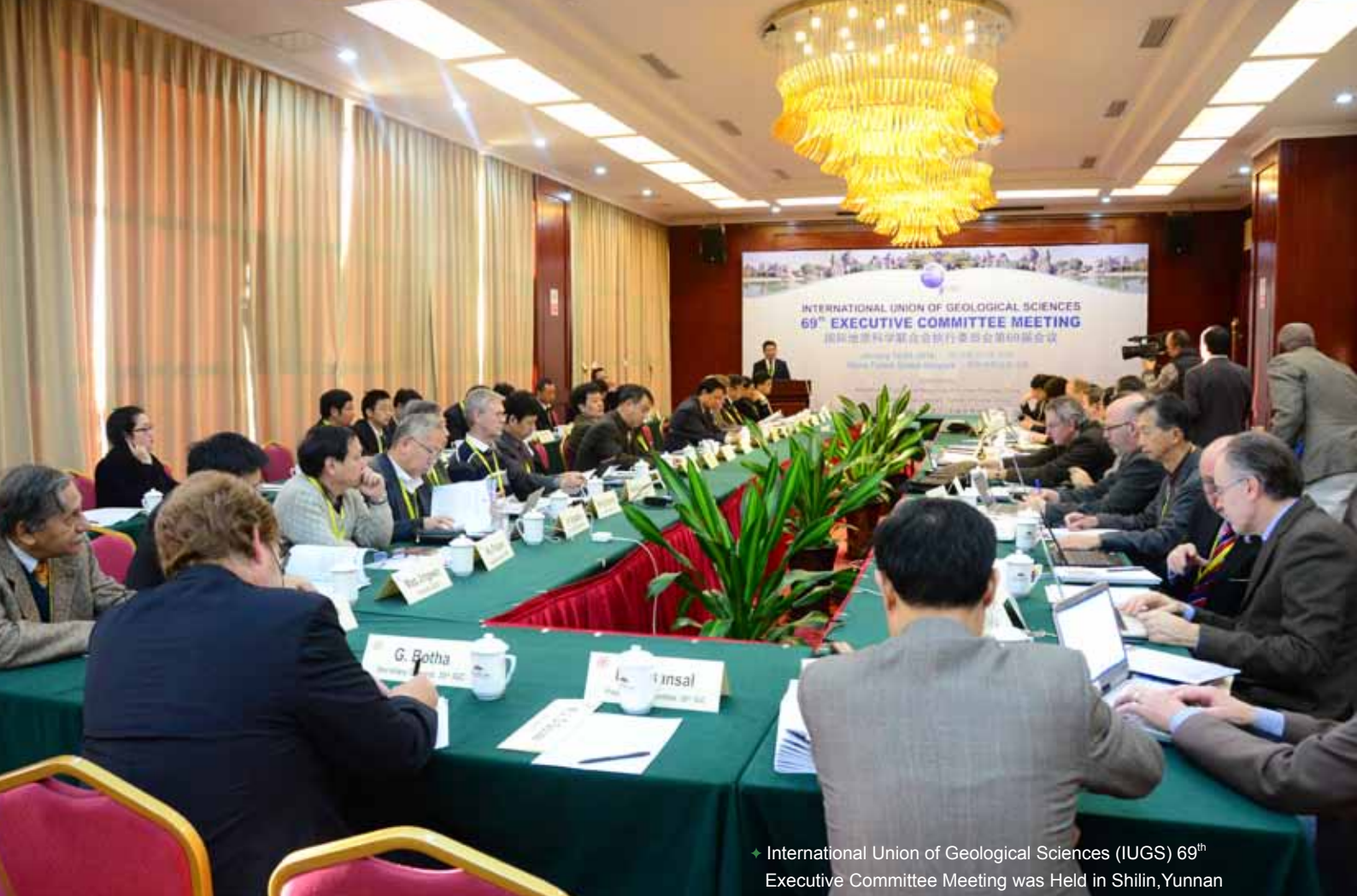
◆ International Union of Geological Sciences (IUGS) 69 th Executive Committee Meeting was Held in Shilin, Yunnan