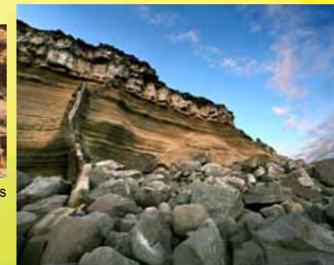
✦ Reykjanes (Iceland)