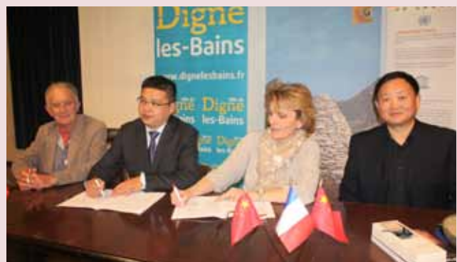
✦ Signing partnership agreement