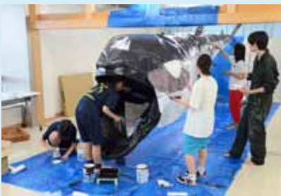
✦ high-school student working together

this year, “Muroto UNESCO Global Geopark Deep Sea Expo 2016” is being held to make it possible to fully enjoy the deep sea of Muroto. At Muroto Global Geopark Center, there are exhibitions of the deep sea and deep-sea creatures, such as videos and real specimens. The main exhibition is a mock-up of a huge deep-sea shark, known as the “mega-mouth shark.” A group of students at Muroto High School joined together to make this mock-up. You will be overwhelmed by the size of it for sure. You can also encounter deep-sea creatures at “Aqua Farm,” the deep seawater intake facility. At “Sea-rest Muroto,” a hot bath relaxation facility using deep seawater, you can experience feeling like a deep-sea fish. For lunch, you can enjoy “Muroto Kinme Don,” Muroto’s premier dish, which is made with kinme, or alfonsino—a deep-sea fish.