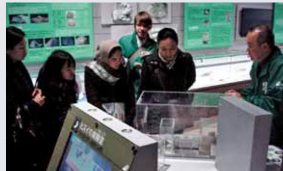
◆ Participants learn about jade and the formation of the Japanese Islands in the Fossa Magna Museum

The tour culminated in an excursion to the Oyashirazu Geosite, where the Northern Japanese Alps collapse directly into the Sea of Japan. This impressive geological formation, a relic from when Japan was attached to the Asia mainland, formed a natural boundary throughout Japan's history. Through participating in exchange programs like this one, the Itoigawa UNESCO Global Geopark hopes to continue to spread the Global Geopark model and facilitate networking among Geopark regions.