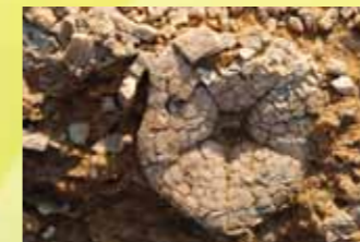
✦ Sitia Global Geopark-Miocene fossils sea urchins (Clypeaster) (Greece)