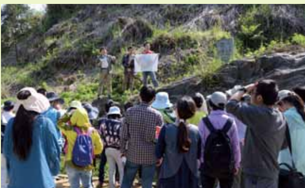
◆ Experts are visiting the Hanchangchong scientific spot

were interested in the outcropped eclogite, garnet peridotite and jadeite quartzite, and they made a discussion and communication. Experts fully affirmed the progressive work Tianzhushan had achieved in the protection of geological heritage, geo-science popularization and the development of geo-tourism. The geopark provides an interactive platform between geologists and the common people, popularizes the geosciences, disseminates the scientific knowledge, enhances the awareness of environmental protection, and promotes the sustainable development of regional economy and society.