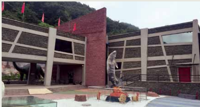
✦ Wangwushan-Daimeishan UNESCO Global Geopark Museum