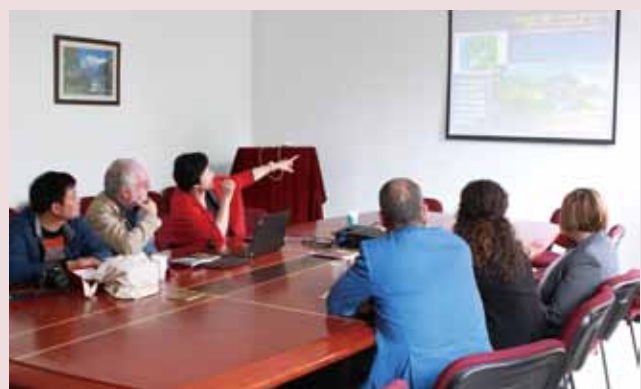
◆ Introducing Shennongjia Geopark