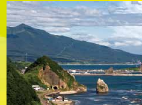
✦ Mount Apoi Global Geopark (Japan)

Office of the Global Geoparks Network (supported by UNESCO and MLR of China) Chinese Geoparks Network Address: 26 Baiwanzhuang Road, Beijing, 100037, P.R. China Tel: +86-10-68999623 Fax: +86-10-68310894 Email: cgn@cags.ac.cn Website: www.globalgeopark.org