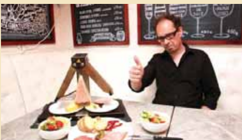
◆ Chez Raymond De Paris: Lava-like Assorted Melting Cheese