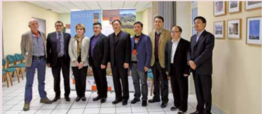
✦ Shennongjia Delegation and local government leaders