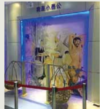
◆ Newly built science popularization education centre ◆ Center of Scientific Education