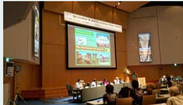
➤ A representative from Thailand presents on Geopark Activities there

Following the forum, attendees took part in one of two excursions, either to Sado Island Geopark or Itoigawa UNESCO Global Geopark. Visitors to Itoigawa explored the story of the world's oldest jade working culture, born along a plate boundary.