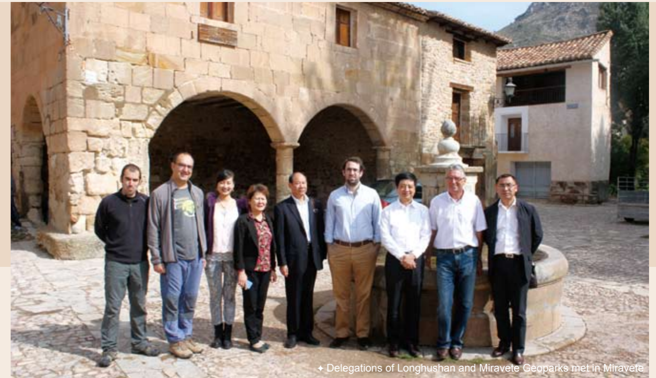
Delegations of Longhushan and Miravete Geoparks met in Miravete

Berriasian Villar del Arzobispo Formation (Upper Jurassic-Lower Cretaceous). After research and preservation activities (conducted by palaeontologists and preparators of Dinópolis-Teruel/Museum of Palaeontology of Aragón), on-site information of the palaeontological features of Miravete 1 track site has been placed and officially promoted. Thus, its opening was celebrated during last European Geoparks Week, informative talks