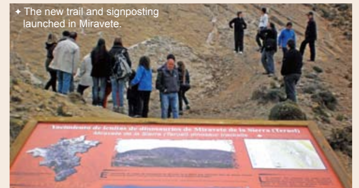
The new trail and signposting launched in Miravete.

to local people were scheduled, and even an agreement between Longhushan Global Geopark and Maestrazgo Global Geopark was signed in Miravete. Other similar signposting were installed in the municipalities of Bordón (describing an anticline), Aguaviva (explaining the Bergantes river fluvial dynamics), Alcorisa (featuring a progressive angular unconformity), and Molinos (introducing geological setting).