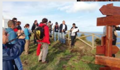
✦ Field trip_Graciosa island