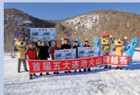
✦ Group photo