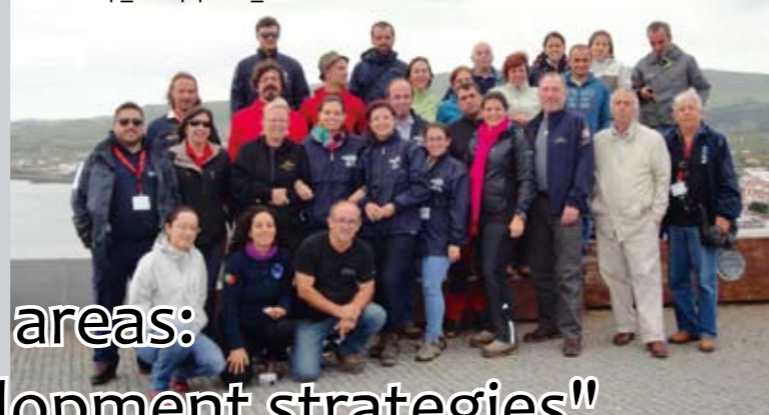
✦ Field trip_Group photo_Terceira island

Also a special mention is given to the presence of internationally renowned geotourism experts, such as