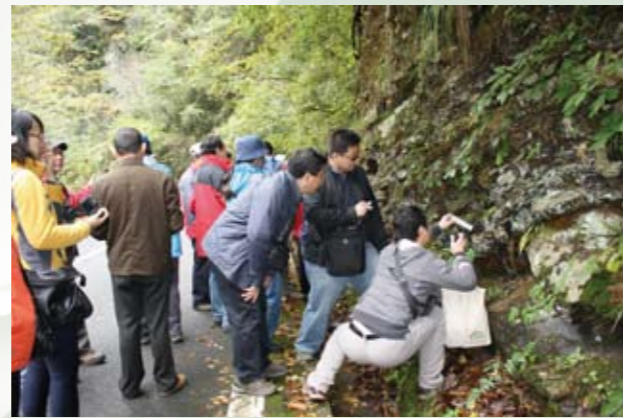
→ Field investigation