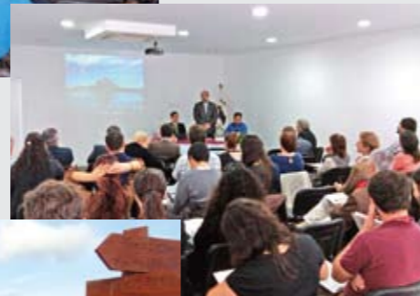
✦ Workshop Geoparks in Volcanic regions Sustainable Development Strategies