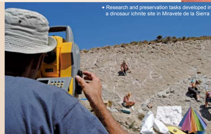
Research and preservation tasks developed in a dinosaur ichnite site in Miravete de la Sierra