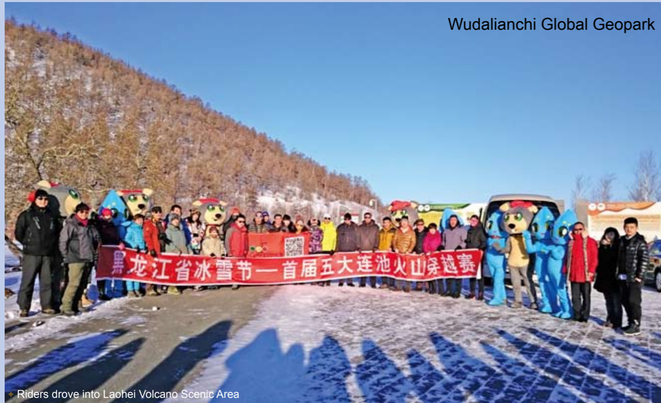
Wudalianchi Global Geopark