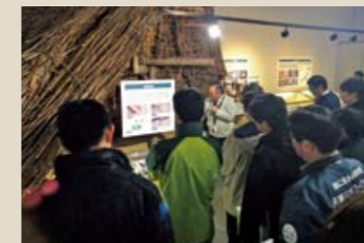
→ The seminar took representatives on the same tour as the GGN Bureau Evaluators

In late November, the Itoigawa Global Geopark hosted a two-day seminar for Geoparks and Aspiring Regions throughout Japan. Taking the form of a mock evaluation tour, this seminar took representatives from participating Geoparks through a recreation of Itoigawa Global Geopark’s most recent revalidation in 2013.