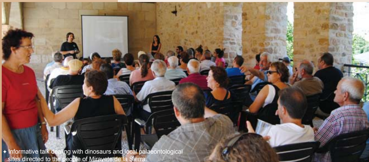
Informative talk dealing with dinosaurs and local palaeontological sites directed to the people of Miravete de la Sierra.