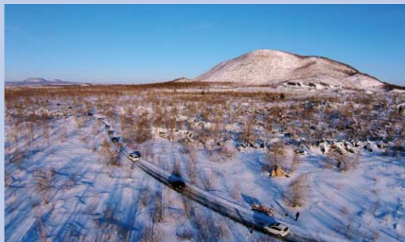
✦ Riders drove into Laohei Volcano Scenic Area