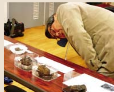
✦ Q&A from participants