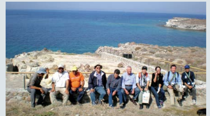
✦ The San'in Kaigan Global Geopark (Japan) delegation during its visit to Nisiopi Lesvos Petrified Forest Park in Lesvos Geopark