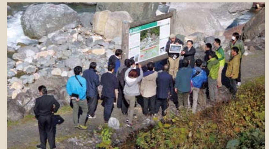
→ Seminar participants learn about signage at the Kotakigawa Jade Gorge

Participants took the same tour prepared for the Evaluation Team. During this tour, Itoigawa Global Geopark Staff shared the comments, questions, and concerns raised by the Geopark Evaluators. The Geopark Model is expanding rapidly in Japan, with 35 National Geoparks, of which 7 are Global