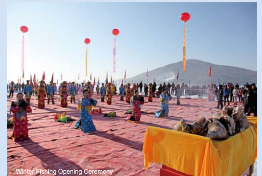
✦ Winter Fishing Opening Ceremony