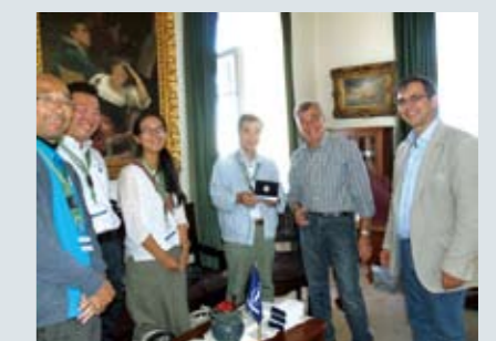
✦ The San'in Kaigan Global Geopark (Japan) delegation meets the mayor of Lesvos Geopark

exchange in matters of mutual interest. 3. Enhance the exchange of school visits. 4. Promotion of scientific cooperation between the University of the Aegean and the Universities of Hyogo and Tottori.