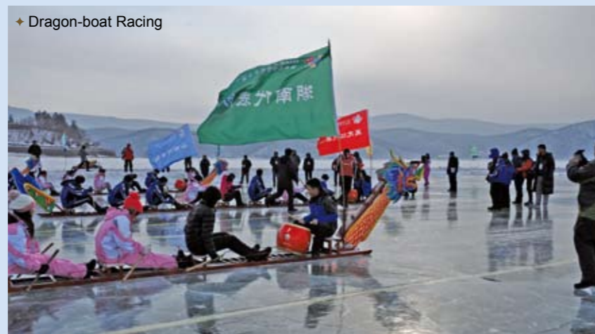
✦ Dragon-boat Racing

apply for hosting the Winter Olympic. We design many competition items in snow and ice environment, such as football, ice hockey, figure skating, hiking, dragon boat racing and snow barriers; some ice and snow entertainments are consist of the snow slide and ice slide, motorized snow circle, ice fishing, ice diving