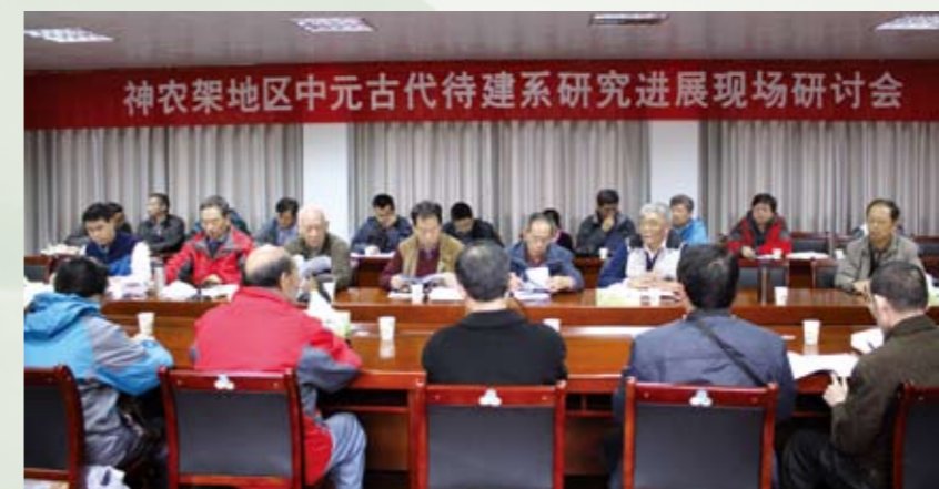
✦ Workshop on Mesoproterozoic stratigraphy Held in Shennongjia

Administration Bureau of the Shennongjia Global Geopark