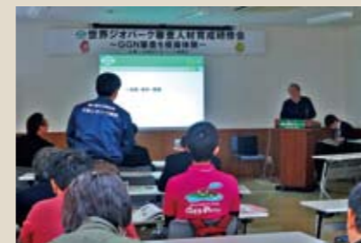
→ Like an evaluation tour, the program began with a series of presentations

Itoigawa Global Geopark, Itoigawa, Japan