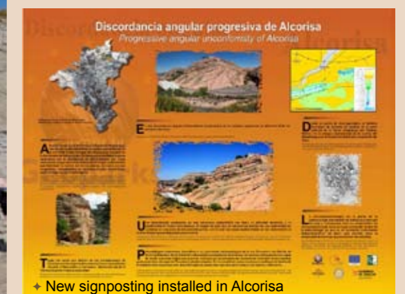
New signposting installed in Alcorisa