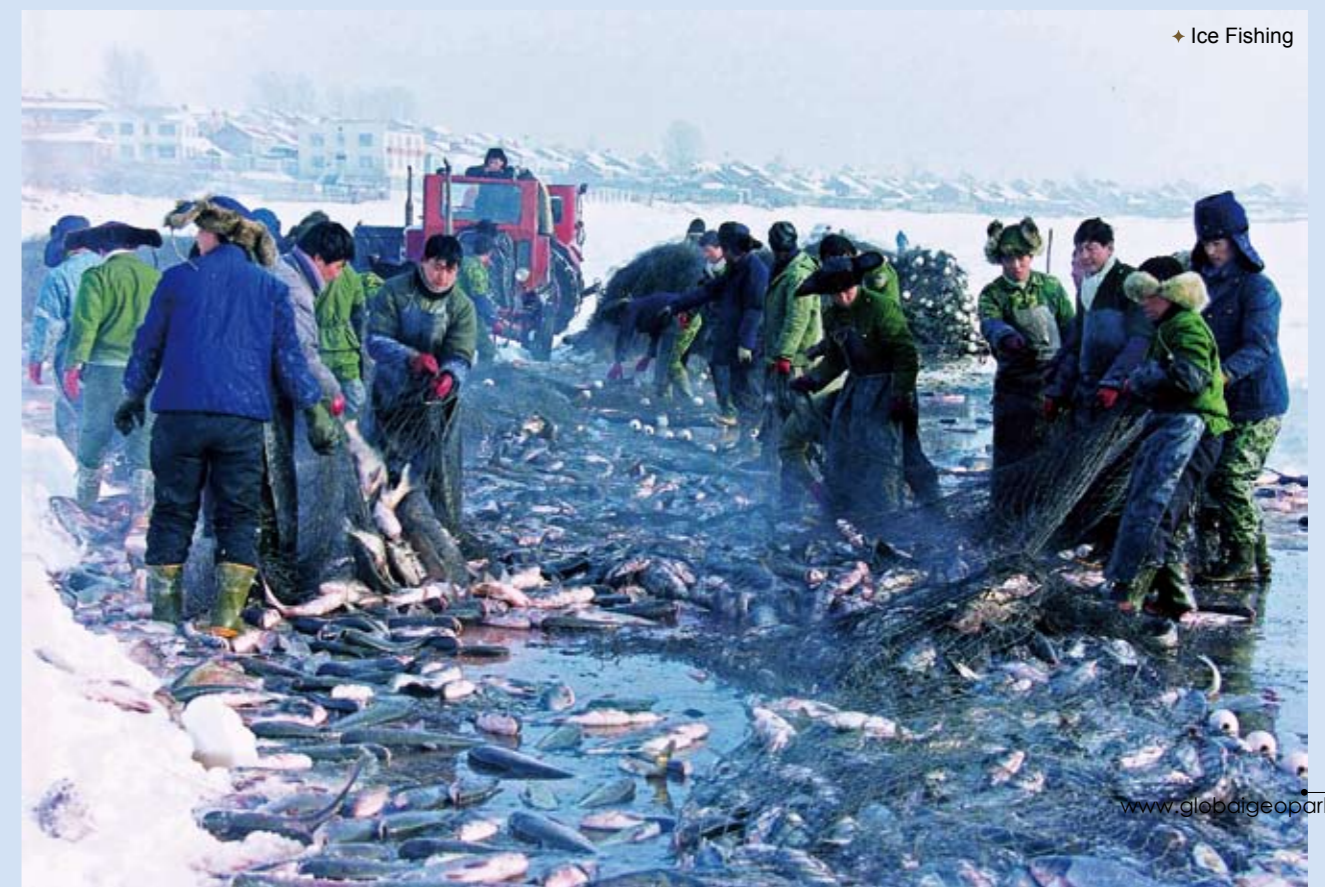
✦ Ice Fishing